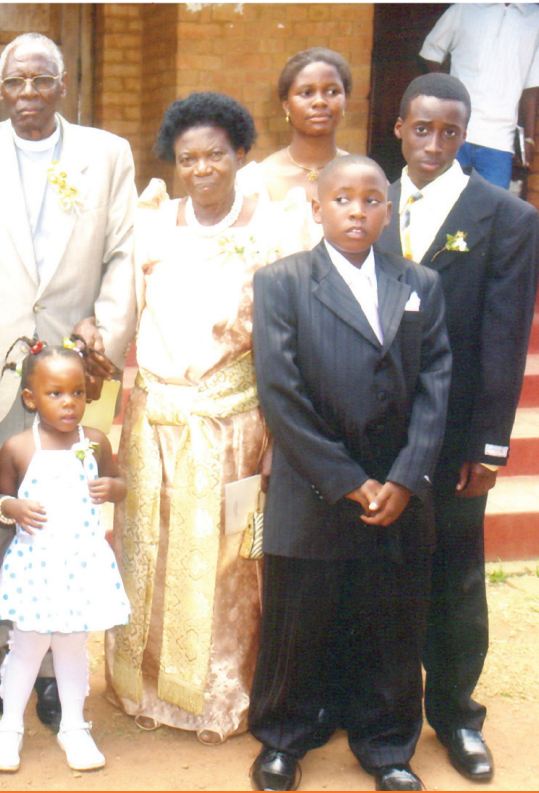
with their grandchildren

On return to her country in 1963, she rejoined the teaching service as Home Economics teacher till her retirement in 1998. After earning a Master of Science degree in Economic Geography at Ohio State University in 1961, I received an Andrew Mellon Fellowship in the Department of Geography at the University of Pittsburgh, in the state of Pennsylvania, USA, for doctoral studies in Geography. In mid 1963, I decided to return to Uganda for my fieldwork for the doctoral dissertation. After three weeks of stay back home, I attended an interview for a Civil service job which I passed very well and was posted to the Ministry of Education as an Assistant