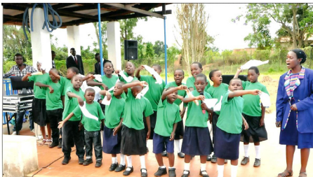
Child Evangelism Fellowship