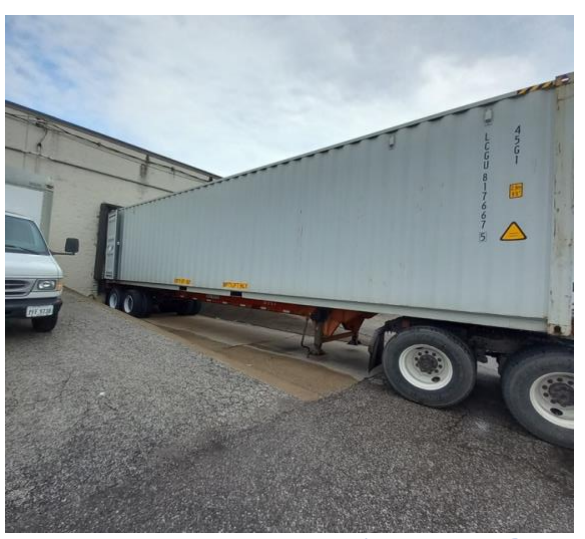
We cannot wait to see our cargo reach Bunia, DR Congo

God to provide CSN finances to be able to pay the demurrage fees for the delay at the port ($6800).